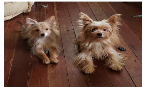
We going to a Car Show, Dad?