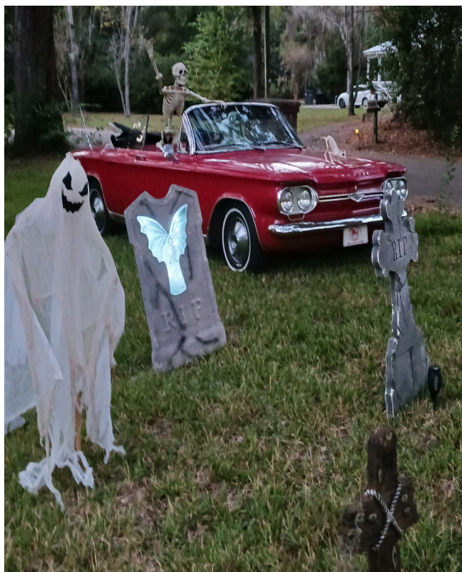
1964 Corvair taken for a joyride by skeletons.