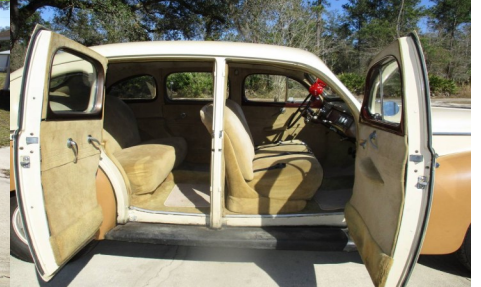
From Cars and Coffee. Nicely built Street Rod.