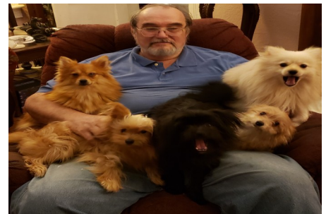
The whole gang is ready for 2023!