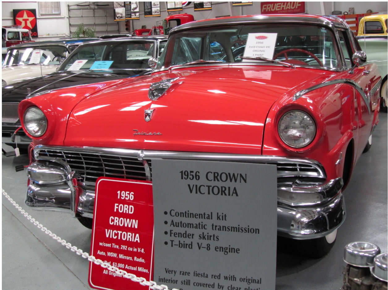
1956 Ford Crown Victoria driven only 63,000 miles.