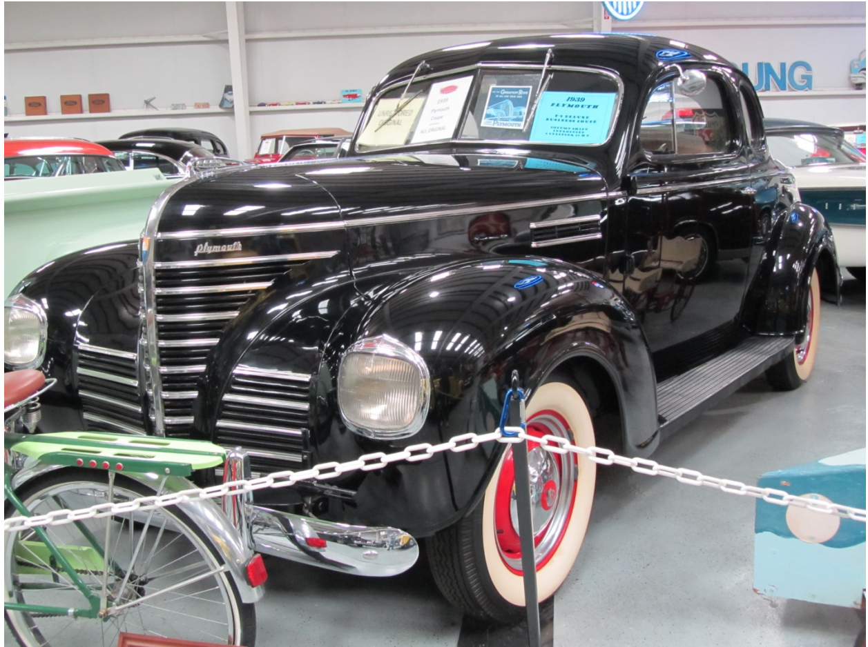
This 1939 Plymouth P-8 Deluxe Business Coupe has been driven just over 46,000 miles.