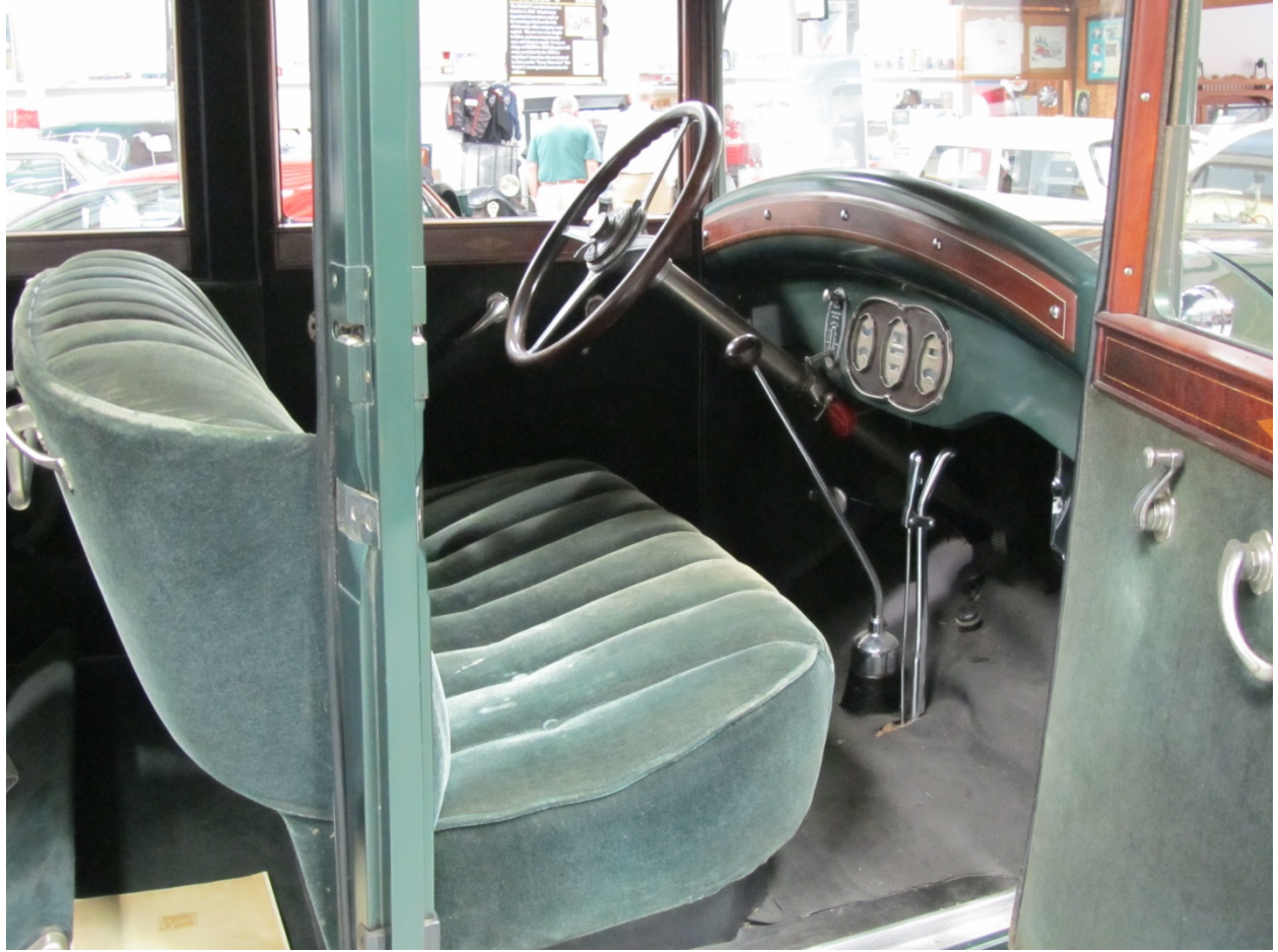
Once inside the Buick, it was evident that it had only been driven about 21,000 miles!