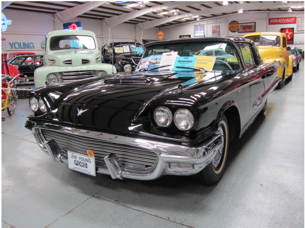
All original 1959 Ford Thunderbird with only 28,000 miles from Uncle Joe Young's dealership. This was one of Uncle Joe's personal vehicles.