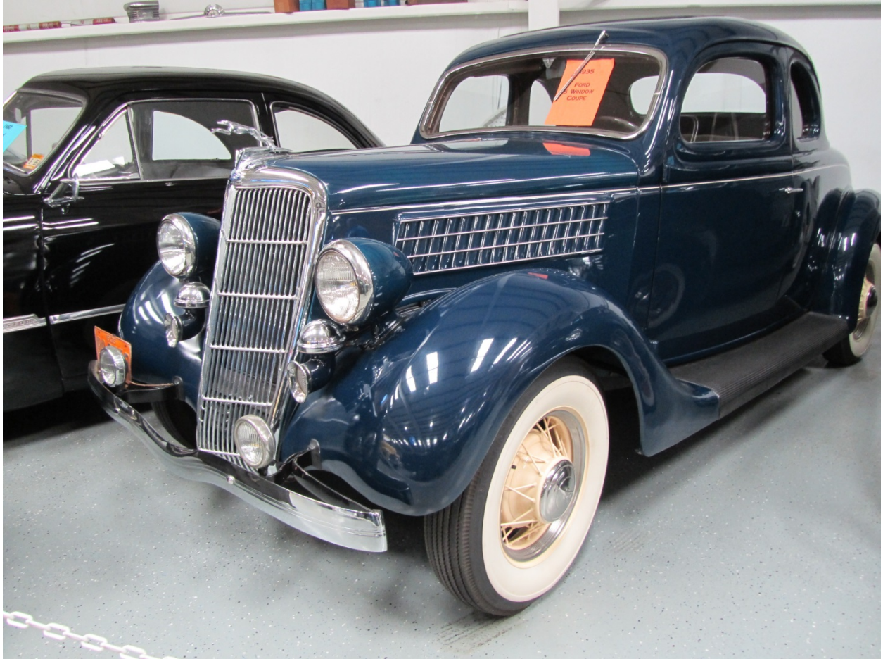
The 1935 Ford 5-Window Coupe looks like Humphrey Bogart just parked it and walked into a seedy joint.