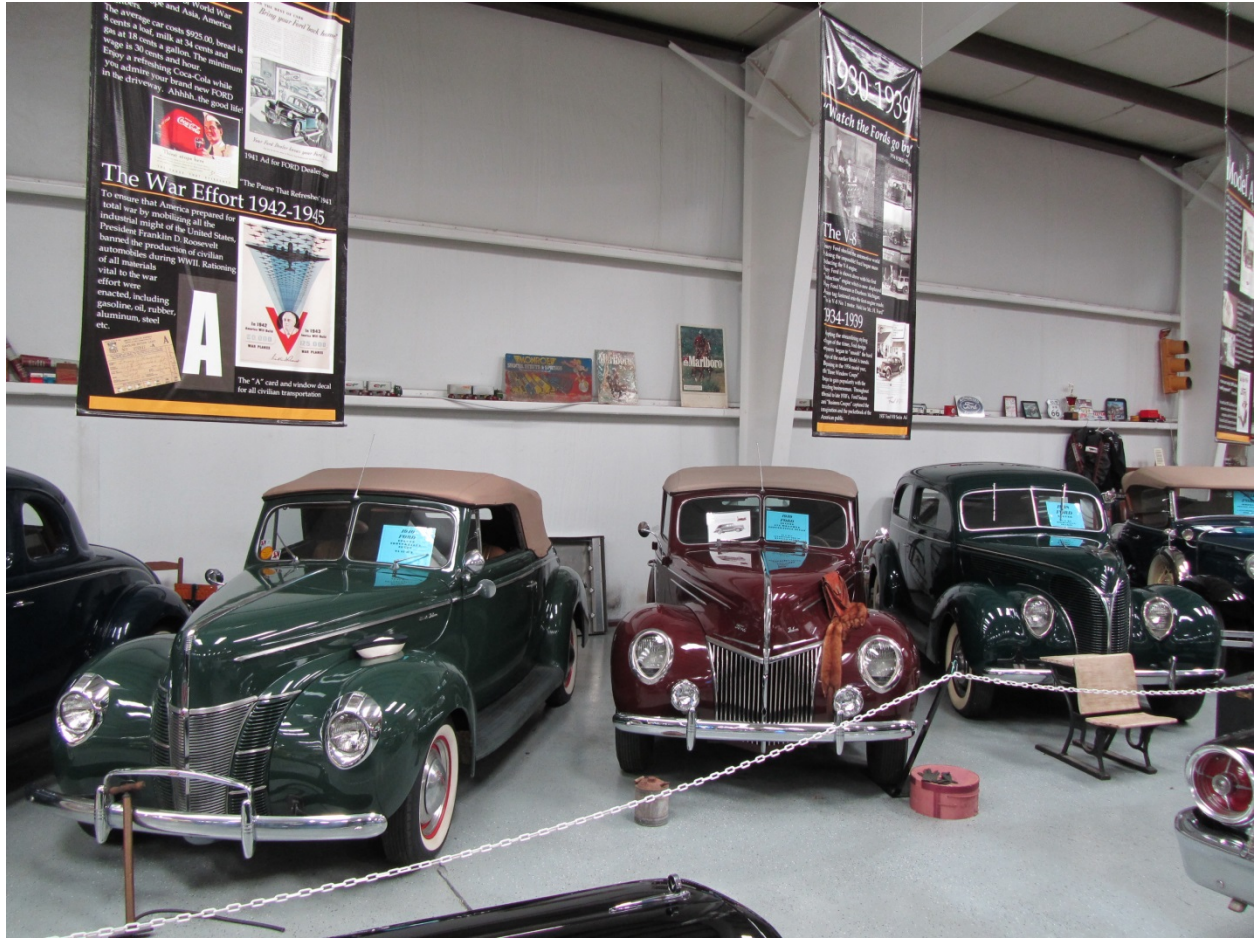
The 1940, 1939 & 1938 Ford Deluxe triplets.