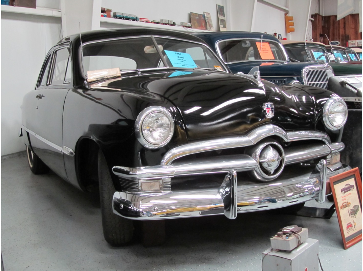
1950 Ford Custom Coupe has chrome so bright it requires sunglasses to view.