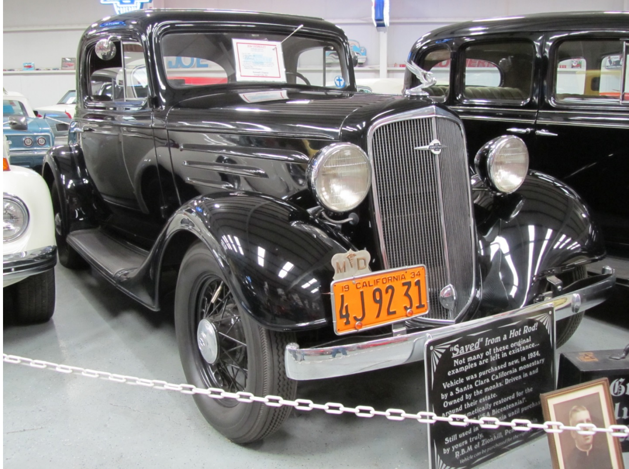
Chevrolet faithful get to see a pristine 1934 Standard Series DC 3-Window Coupe with 46,000 miles. This was saved from being built into a hot rod in 1954.