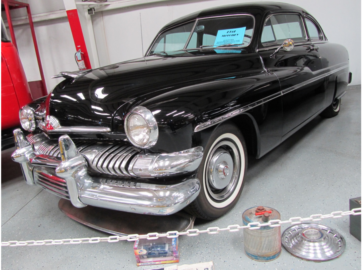
1951 Mercury—black leather jacket and switchblade optional.