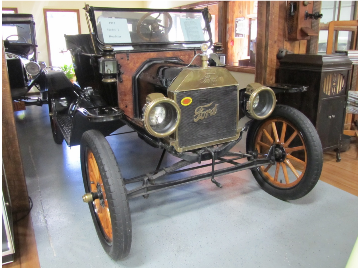
A 1913 Ford Model T Roadster shares an alcove with another Model T just off the entryway.