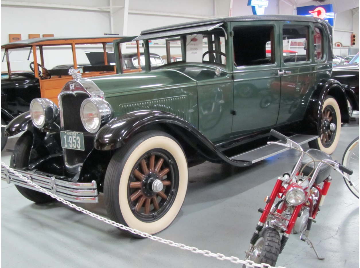
This immaculate 1928 Buick appeared to have just driven off the dealer's lot.