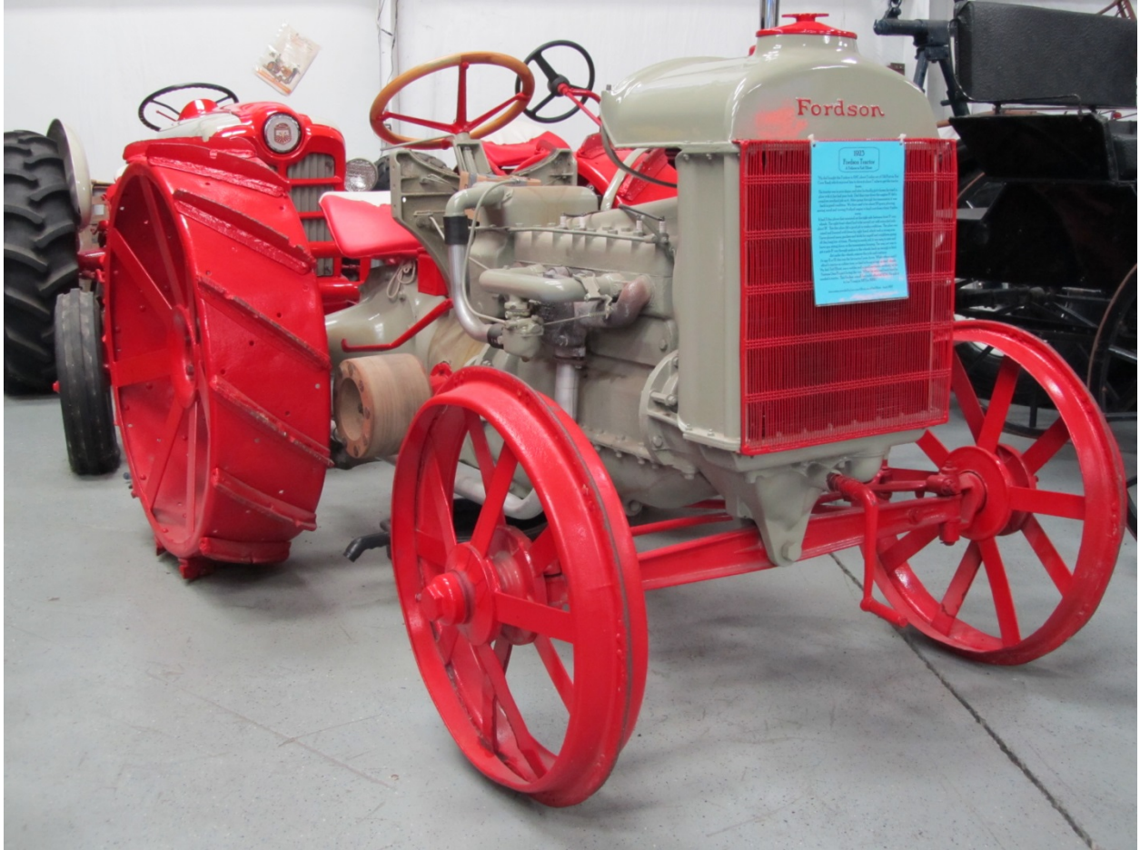
Surrounded by several well-restored John Deere tractors, this 1923 Fordson stood out.