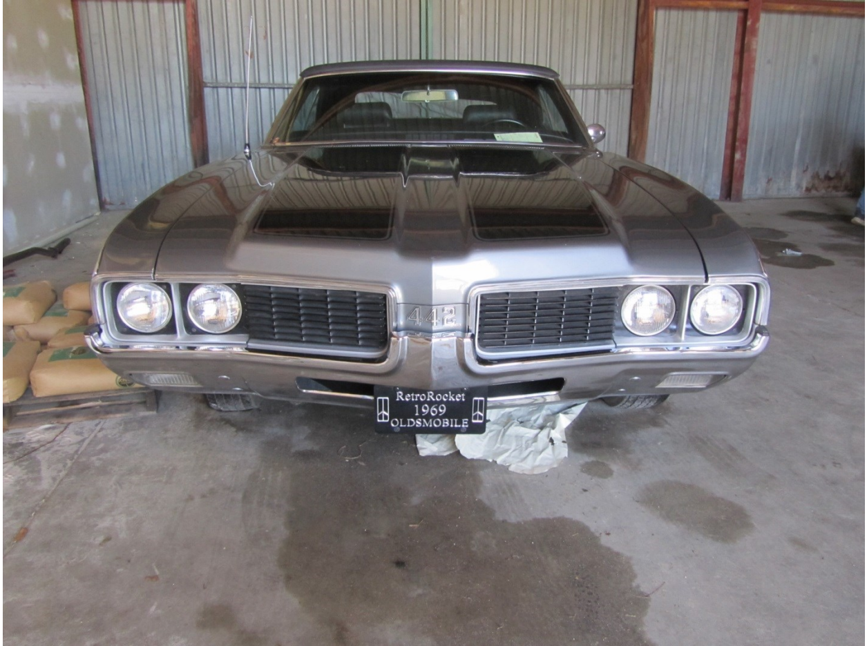
...and a 1969 Oldsmobile 442.