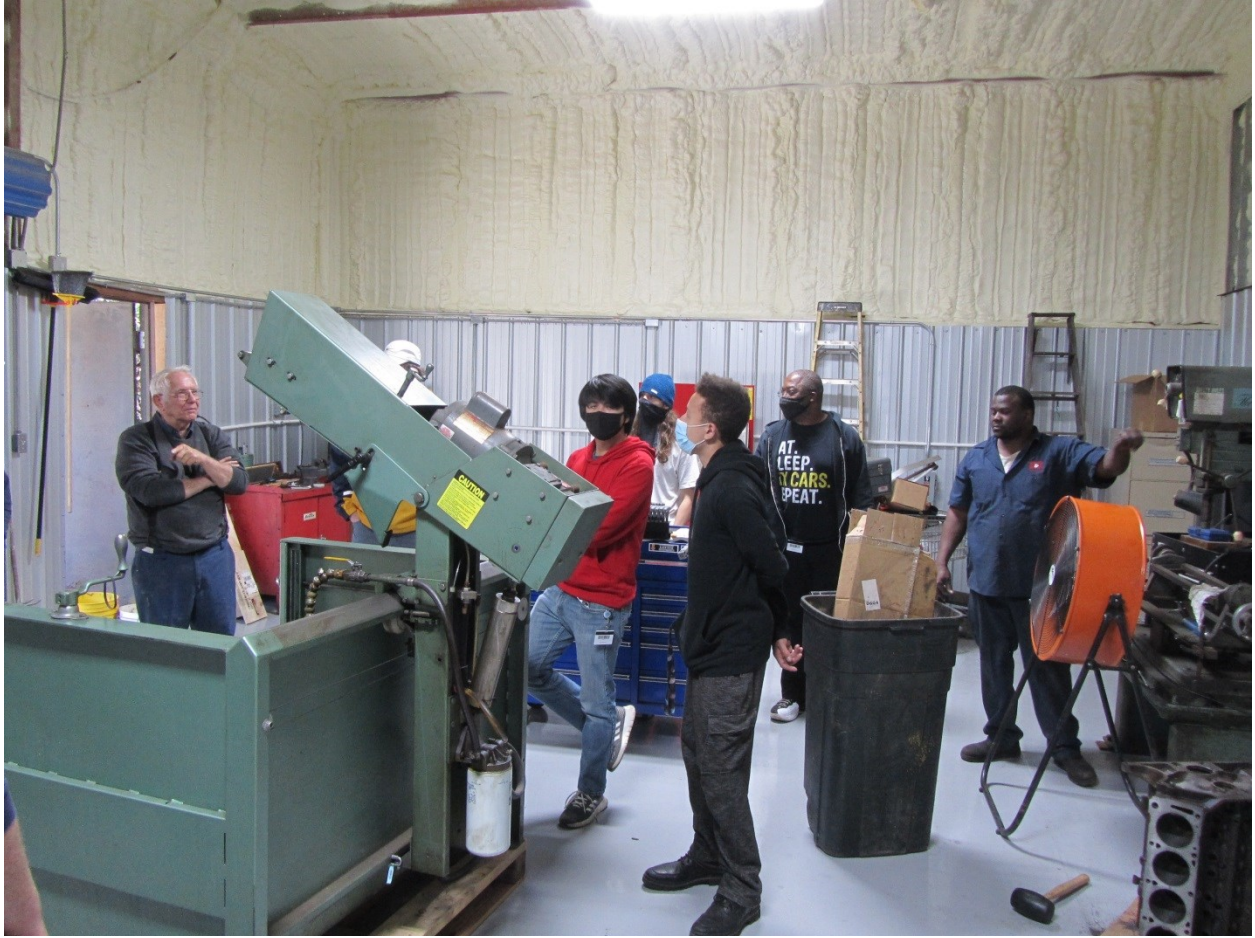
A short walk to out buildings used for preparation and storage yielded interesting artifacts like this Ford Thunderbird...