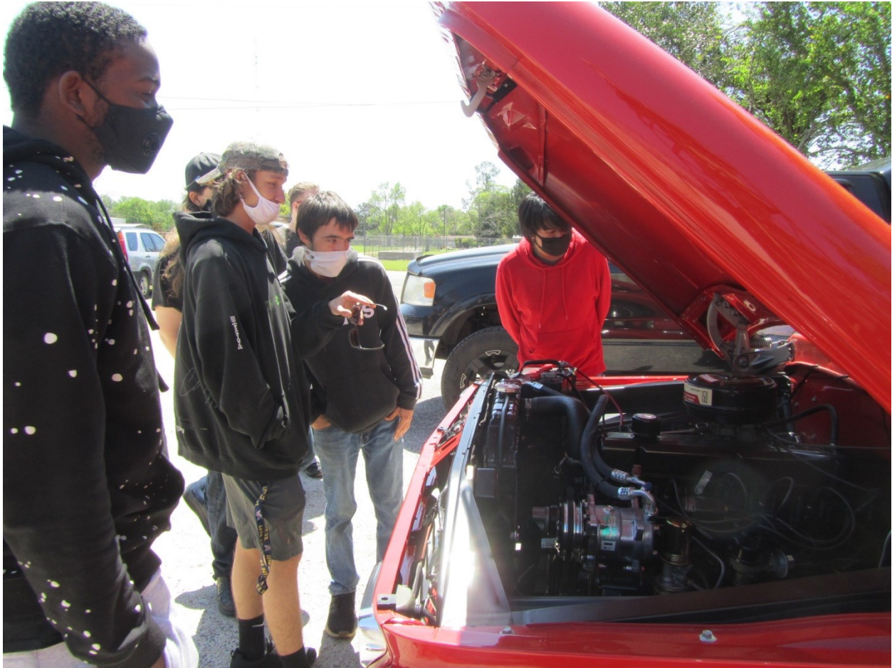
This Ford F-100 has a vintage air system that was installed in the shop. This is the perfect accessory for classic cruising in Florida!