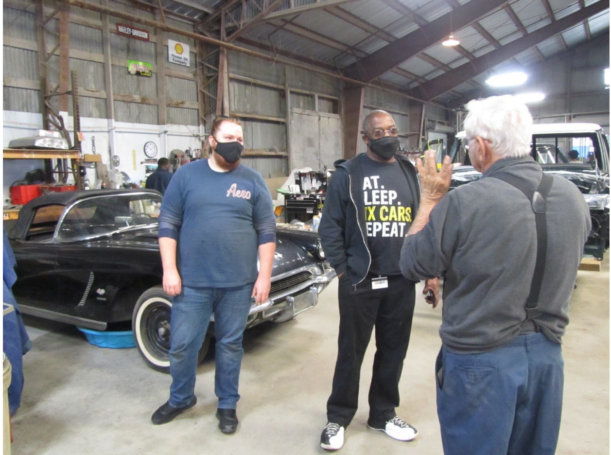
Several pickup truck projects could be seen at various stages in the restoration process. This Ford was one of the examples close to completion.