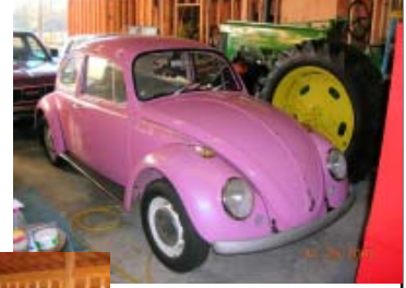
Flower Power in Pink