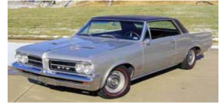
1964 GTO Sedan

For many years I had dreamed of owning the car that started the muscle car era, the Pontiac GTO, the car of both legend and song. It was no accident that my email address contained "gtothree89" and I had purchased a gold 66 GTO sedan 1/26 scale model nearly ten years before actually owning the genuine article. But eventually, it was time to stop cutting bait and go fishing. The hunt was on!