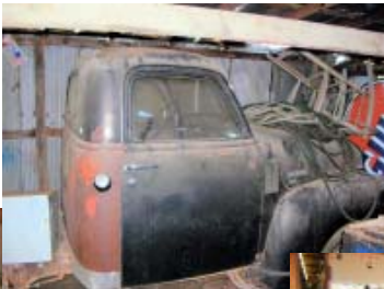
49 Chevy Truck