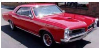
1966 GTO Sedan

Even before I began to look for actual cars for sale, I had previously researched the history and development of the various GTO models. The actual search process also helped to narrow my choices considerably, as I actually drove some GTOs which differed in both model year and how they were equipped. I decided my dream car would be one of the early years from 1964 through 1967, equipped with a manual four speed, bucket seats, center console, convertible body style, and although I was open to several different color combinations, my preference was for one of the original bright red or burgundy colors.