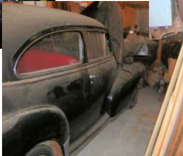
48 Chevy Tudor