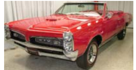
1967 GTO Convertible